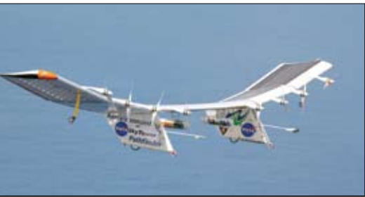
Paul MacCready's Pathfinder ran its eight electric motors from lithium ion batteries recharged by solar cells atop the wing.

MacCready also developed unmanned electric aircraft such as the Pathfinder and Helios for NASA during this period. These aircraft (there were five of them) were powered by from six to 14 2-hp motors mounted in pods on a single flying wing. They were designed for high-altitude loitering with the solar cells collecting energy during the day to run the motors and recharge the lithium-ion batteries for uninterrupted flight at night. This series culminated with the Helios, which had a wingspan of 247 feet and flew to 95,000 feet. The