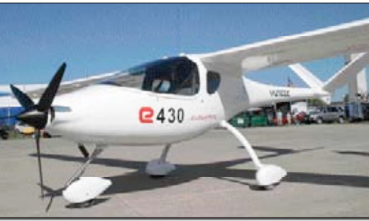
The Yuneec E430 from China appeared last June. It's LSA eligible, and may fly for 2.5 hours on a charge.

I was fortunate enough to attend the third CAFE Electric Aircraft Symposium, held at the Hiller Aviation Museum in San Carlos, California, on April 24, 2009. The estimated 150